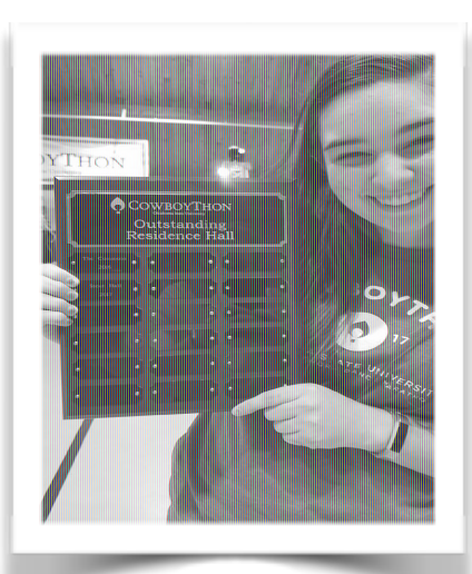
Holding the Most Outstanding Residence Hall for Stout Hall at the 2017 Cowboython.